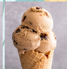
Rum & Raisin